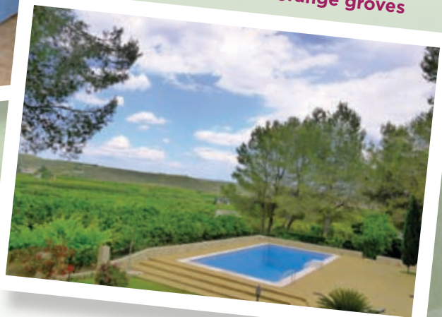
View from the balcony overlooking the orange groves