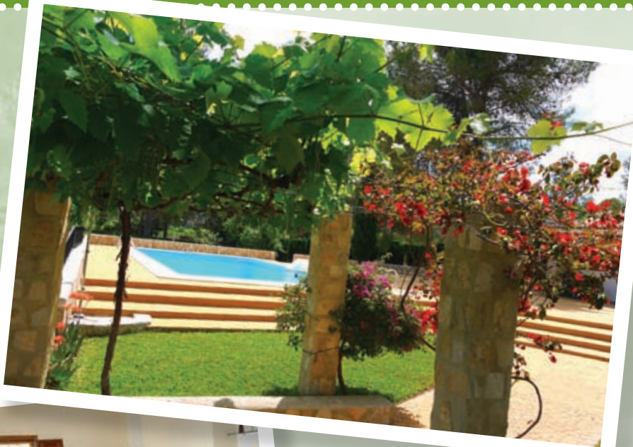
The pool and terrace